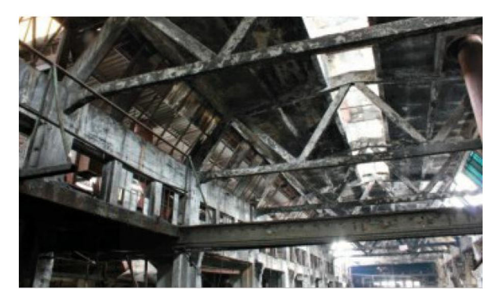
Picture 2. Main factory building roof construction

Facilities of both the screws' factory and stove factory had a similar construction in 1913. The factory complex was extended during the interwar period: a dry-kiln was built in 1917, following the construction of the building for officials and workers in 1919, work of the architect Ivan Domes.