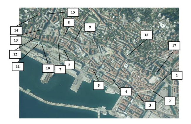
Figure 1. Orthophoto view of the analysed area [6]

The road network in the city centre is limited by the existing urban infrastructure. For the purpose of this research, bus stations in the wider city zone with highest traffic volumes are analysed. Their positions are shown in Figure 1.