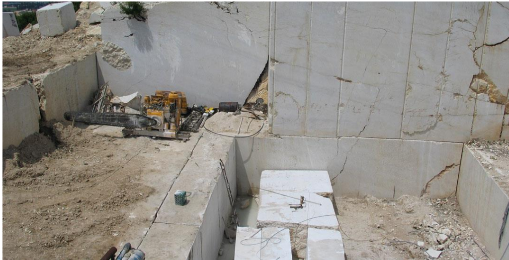
Figure 2. Part of Pogledala quarry

the analyses established that the stone meets all quality aspects, the development of a study on reserves and quality was undertaken in 2003 (Bilopavlović, 2003). From then until today, the extraction at the Pogledala limestone deposit has been going on continuously (Figure 2).