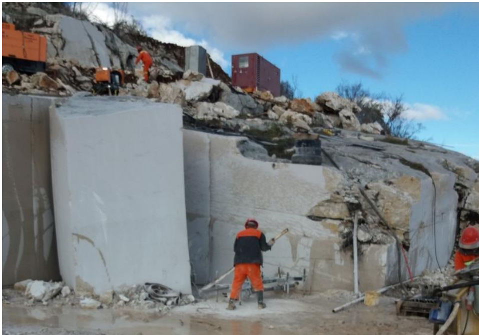
Figure 6. Works on the opening of trial exploitation levels at the "Kik 2" quarry (Kik stone d.o.o. Livno)

On the southeastern slopes of the Dinara mountain, in the Upper Cretaceous rudist limestones, there is a deposit of dimension stone "Kik 2". It is located on the southwestern slopes of the Kik hill, which descend towards the Vaganj mountain saddle. On this terrain, the company "Kik stone" d.o.o. Livno conducted investigations in two localities. The first locality is about 200 meters from the asphalt road leading to the town of Sinj in the Republic of Croatia. The investigation area was named "Kik". Soon thereafter, the same company started investigations about 200 meters to the north in the investigation area "Kik 2", the area of which is 4.73 hectares. Geological investigations have shown that the rock masses in this locality are less fractured and of higher quality than in the previous locality. A decision was made to elaborate the reserves of dimension stone at the "Kik 2" locality and to conduct a trial exploitation of the allowable quantities of stone (Figure 6).