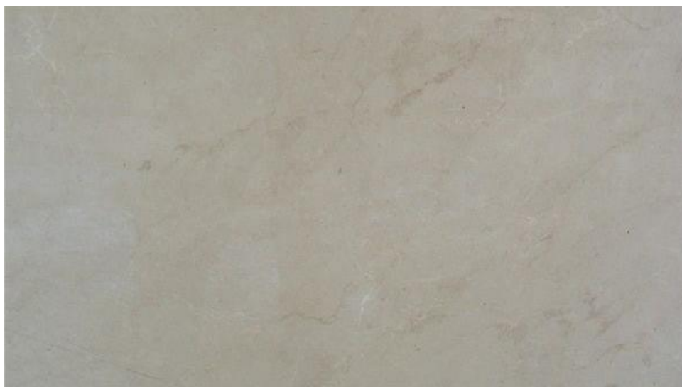
Figure 7. A polished sample of limestone from the Kik 2 deposit (Kik stone d.o.o. Livno)

The color of the limestone from the "Kik 2" deposit is light gray, less often gray-brownish to ocher. Shades of darker color occur in some places (Figure 7). The stone is massively homogeneous in texture. On the cut surface of the stone, irregular forms of millimeter size, which are lighter in color than the base, can be observed. Straight fractures 1 to 2 mm wide, most of which are filled with lighter calcite infilling, occur in some places. There are also those the calcite infilling of which is darker in color. Stylolitic seams can also be seen. The stone has an irregular fracture.