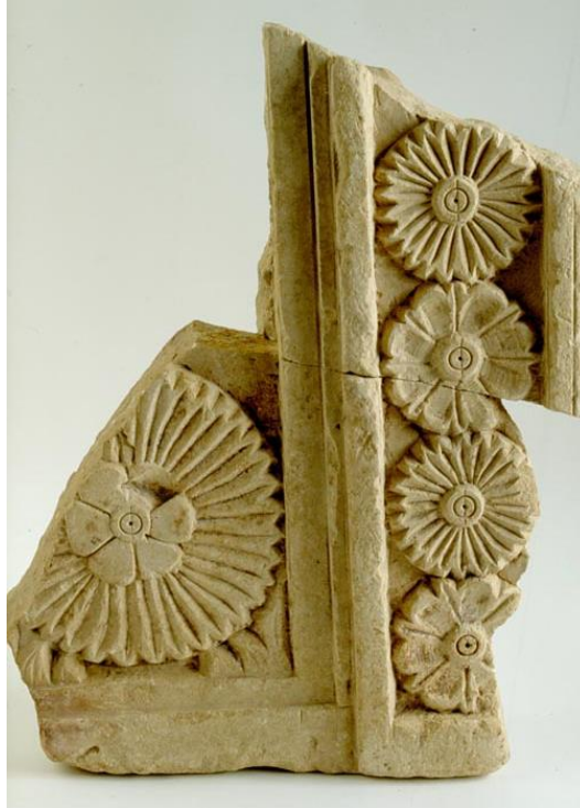
Figure 1. Fragment of pluteus (altar partition) from the basilica on Rešetarica, (5th-6th century) made of Miocene freshwater limestone (probably from the quarry on Bužanin hill) (Franciscan Museum and Gallery Gorica Livno, 2008)

Numerous stone objects found in the Livno area, which date from the Roman period, are kept in the Franciscan Museum and Gallery of Gorica.