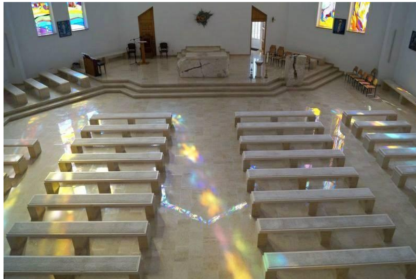
Figure 4. Interior of the Church of Our Lady of Angels in Livno made of Silit light stone (Silit d.o.o. Livno)

Hall, the pavement in several streets in Bašćaršija, the Franciscan Museum of Gorica in Livno, Hotel "Casino" in Brčko, the church of Our Lady of Angels in Livno. In Croatia, in fierce competition with stone from numerous Dalmatian quarries, it has secured its place in the market, where it is constantly increasing its share. The waterfronts in Makarska, Rijeka, Trogir, Ploče, Šibenik are paved with silit, and so are the main street in Skradin, the port in Ploče, Kalalarga street in Makarska, the facade of the HP Post Office building in Split, the Skywalk Promenade on Biokovo. In addition to taking its place in the markets of Bosnia and Herzegovina and Croatia, Silit light is installed in numerous residential and commercial buildings in Germany, Italy, Great Britain, and Slovenia. Today, this stone is exported to Croatia, Slovenia, and Italy, and thanks to its quality, it has also found its place in the distant Chinese market.